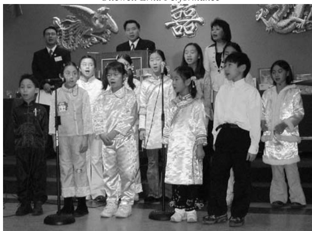
School Ensemble – Singing National Anthem