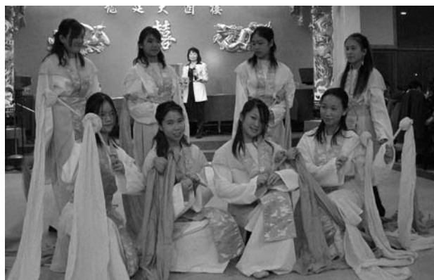
McNally Ribbon Dancers