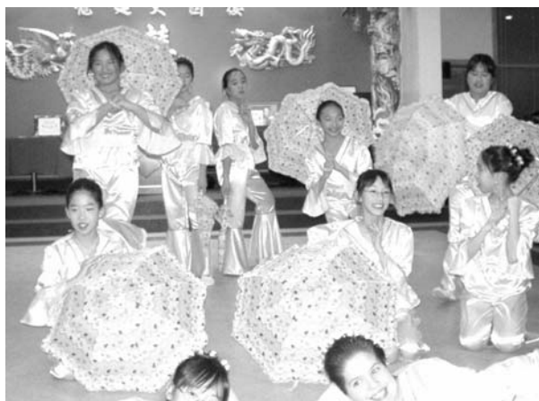
Kildare Umbrella Dancers