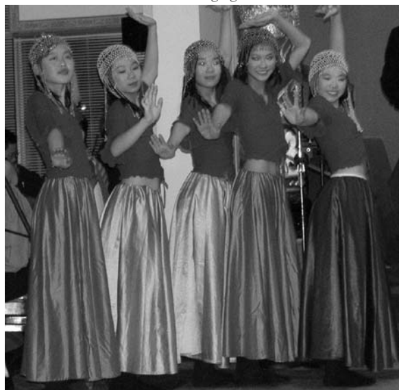
Ottewell Xin Jiang Dancers