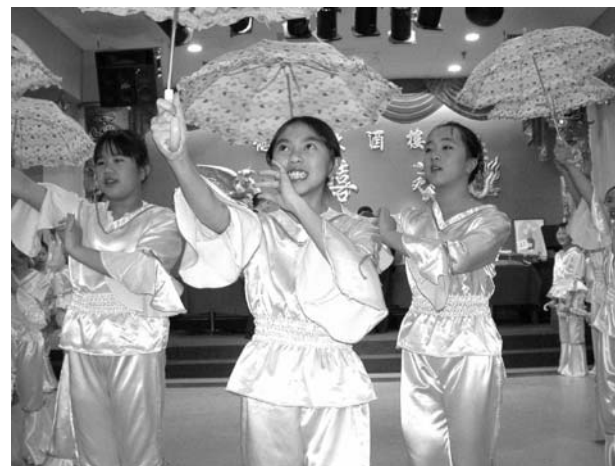
Kildare Umbrella Dance