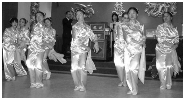
Londonderry Handkerchief Dance Troupe

We would like to thank the following groups: Caernarvon Flower Drum, Red Handkerchief and Kung Fu. Dovercourt Recital of Chinese New Years Celebration Kildare Pull Bell and Umbrella Dancers Meyonohk Lion Dance and Song & Smiles Dancers Meadowlark Songs & Smiles Dancer Londonderry Handkerchief Dancers Ottewell Erhu Solo and Xin Jiang Rosslyn Zhumulangma Dancers McNally Ribbon and Lion Dancers ME LaZerte Ha Die Dancers and Fashion Show