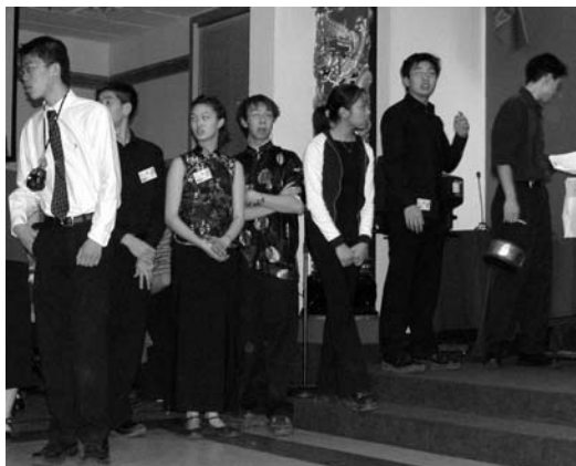
McNally Students Distributing Prizes

The ECBEA would also like to thank all of the student