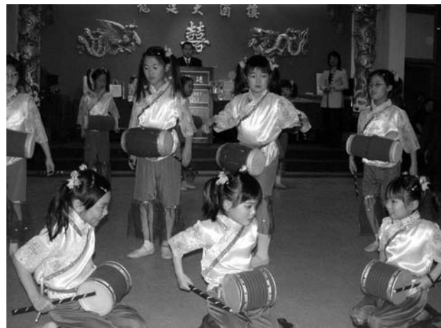
Caernarvon Flower Drum Dance Group