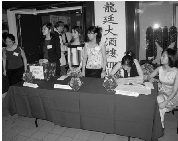
McNally Students Helping At Banquet Reception