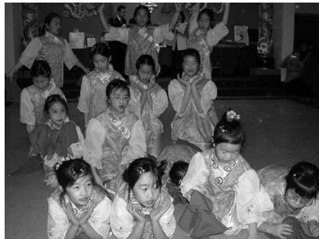
Caernarvon Handkerchief Dance Group