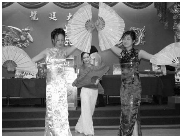
MeLazerte Fan Dancers