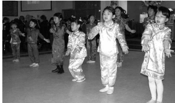
Meadowlark & Meyonohk Dancers

The 500 plus people in attendance at the banquet were thoroughly entertained by the students from our program schools.