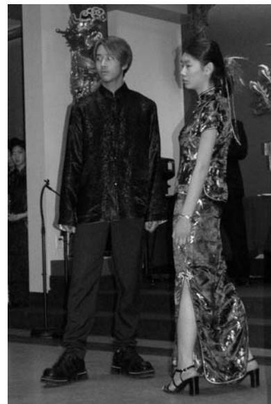
ME LaZerte Fashion Show