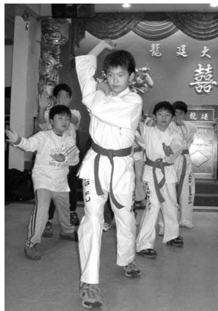
Caernarvon Kung Fu