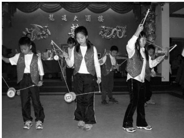
Kildare Pull Bell Team