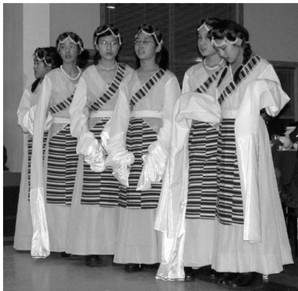
Rosslyn Zhumulangma Dancers