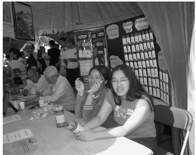
Londonderry & Kildare Student Volunteers

The volunteers from the ECBEA were not limited to just the executives but many students from the program schools such as Londonderry, Ross Sheppard and Kildare.